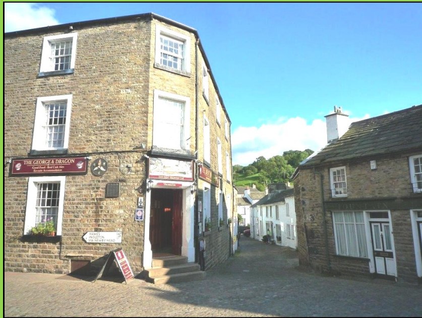
The George & Dragon, Dent West Pennines & Cumbria CIDER PUB OF THE YEAR - 2013

Magazine of the Westmorland Branch of CAMRA