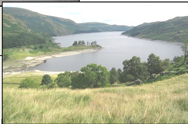
Haweswater, there is a village under here