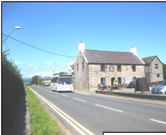
The Prince of Wales, Kenfig, Nr Porthcawl, Wales, with bus and in great weather.

and pence (except pounds never came into it). But it was still lovely and awakened a memory from way back of a description of UK beer as being "warm and flat as ink" and that is how it should be. By warm I don't mean you have to let it cool down, I mean not cold.