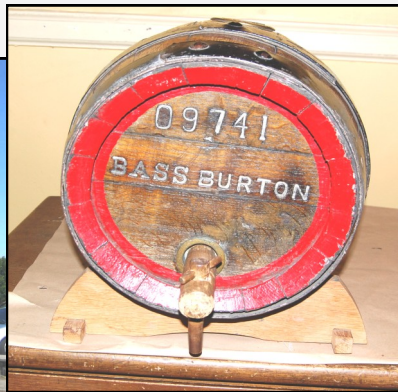
The way it was