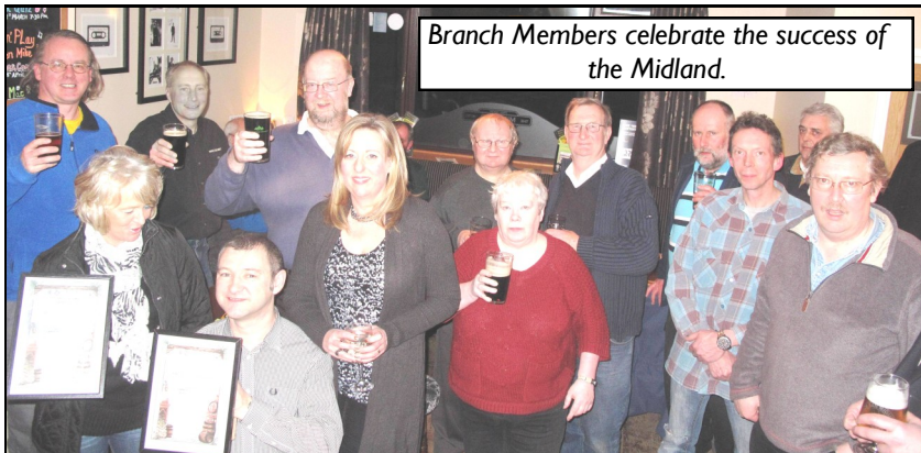
Branch Members celebrate the success of the Midland.

delight that visitors to Appleby have the opportunity to enjoy local produce in such comfortable