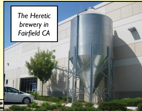
The Heretic brewery in Fairfield CA

chairs and tables set out within the brewery itself. Food was provided by a food truck parked outside, the fare varies day by day. Their website with the stirring opening words "Ordinary beer is boring. Don't drink it" lists 16 different