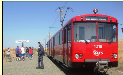
A San Diego car out in the wilds at Pantano on the Rio Vista museum line.

Sacramento. It is a delight of a place based on part of the old interurban line between the two cities and having several preserved examples of these splendid beasts that are a cross between a tram and a train and have always fascinated me. They weren't using one the day we visited but we did ride a vehicle from San Diego