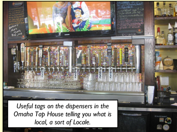
Useful tags on the dispensers in the Omaha Tap House telling you what is local, a sort of Locale.

organisation should be envious of. CAMRA has been around for going on for 45 years, any organisation existing for that long needs to consider its continuing relevance. Today's beer scene could hardly be more different, in the 1970s I drove from Kendal to the Drunken Duck at Barngates for a pint of