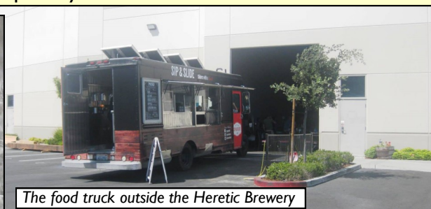
The food truck outside the Heretic Brewery