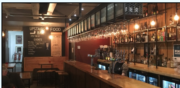
57 Thomas Street