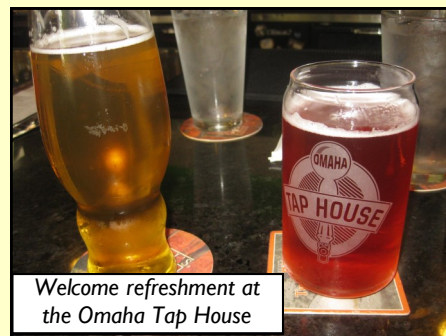
Welcome refreshment at the Omaha Tap House

and you really do appreciate a refreshing beer in such circumstances. Both, a traditional lager and a honey flavoured bitter were exactly right for the weather,