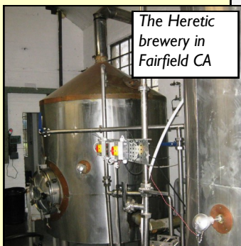
The Heretic brewery in Fairfield CA