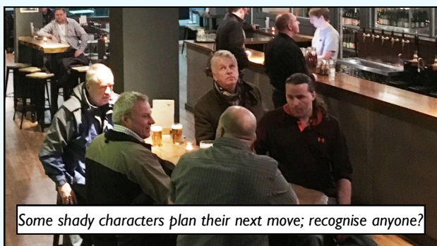
Some shady characters plan their next move; recognise anyone?