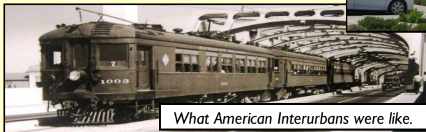
What American Interurbans were like.

and out whilst it was a mere 80F. Having taken in some sights, the Tap House was irresistible